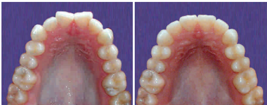
Rotated, crowded anterior teeth.

At first glance you may think you need braces, however with the patented Inman Aligner , your front teeth can be gently guided to an ideal position quickly and effectively, in a matter of weeks.